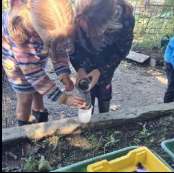
Year 3 were filtering dirty water to see if they could make it clearer using different fabrics in outdoor learning

Love for God ~ Love for Each Other ~ Love for Learning