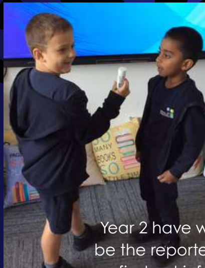
Year 2 have worked in partners and taken turns to be the reporter and the Roly Poly Bird on a quest to find out information on the missing Enormous Crocodile's whereabouts!